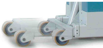
Option Variable wheelbase Stroke 500mm